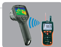
Wireless METERLiNK™ Communication via Bluetooth®