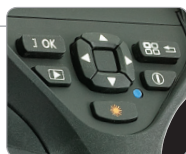
Large Backlit Buttons For Easy Push Button Operation