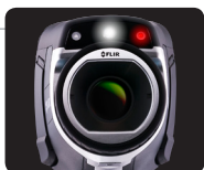
Visible Light Pictures Align with Thermal Images: 3.1MP Digital Camera, LED Lamp, and Laser Pointer