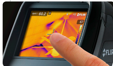
Large 3.5" Touchscreen